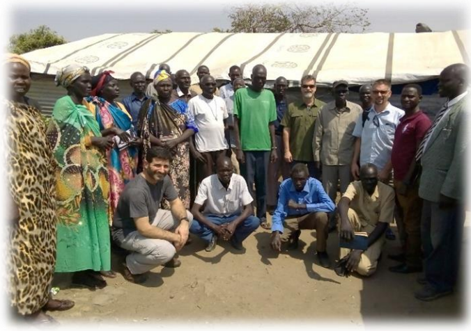
Participants of Leadership Training conducted at IDPs camp, Juba in partnership with OPC

Through International Conference of Reformed Churches (ICRC), SRC has connected to Orthodox Presbyterian Church (OPC). Both denominations are members of ICRC. It is worth mentioning that some of the purposes of ICRC is to encourage cooperation among the member churches in the fulfillment of the gospel missionary mandate and to present a Reformed testimony to the world. Encouraging cooperation between OPC and SRC is being