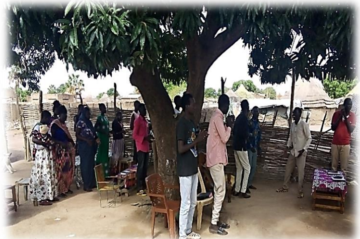
Mercy SRC Wau during Sunday worship service