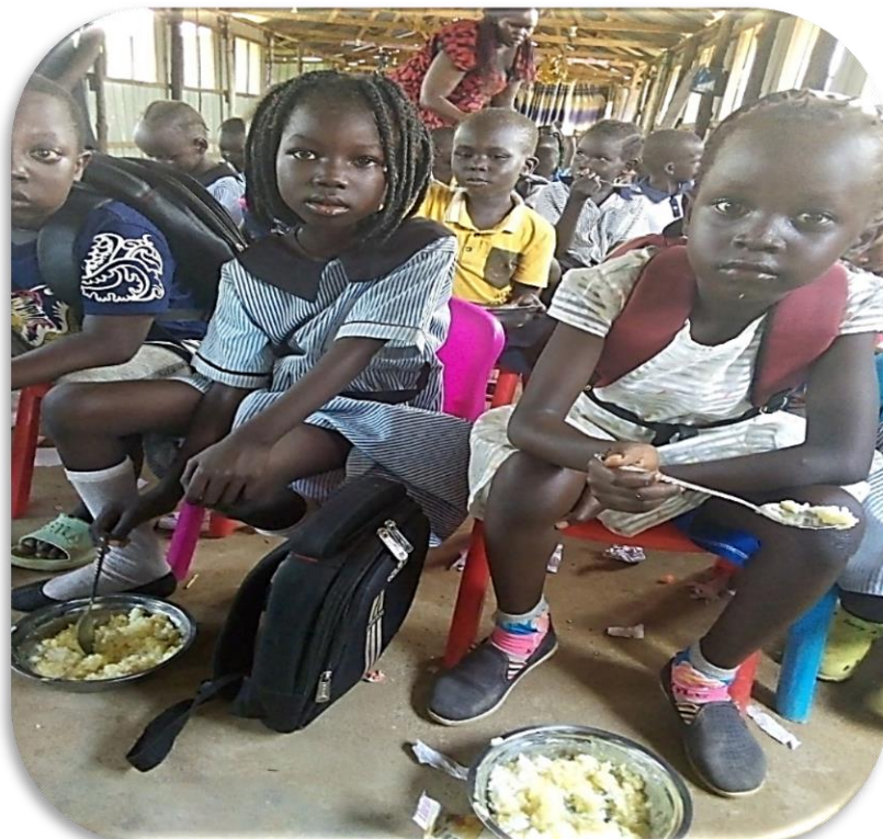
Enjoying God's provision and grace

Through the School Feeding Program carried out in partnership with WORD & DEED , SRC has been supporting 850 pupils with school meal five times a week totally to 22 days a month. Having food at school every day for every child makes better nutrition, health, and readiness to learning. The whole project is scheduled to run for a period of one (1) year as from 1 st May 2022 – 30 th April 2023.