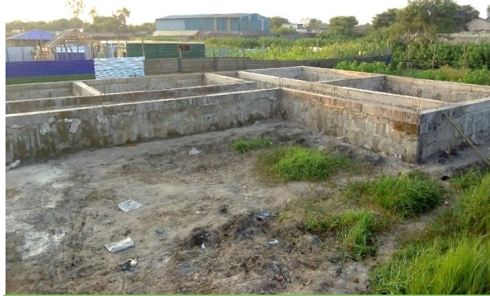
Foundation of Bethel Secondary School, Juba

One of SRC key strategic goals is to influence the sphere of education through Reformed witness. Joyfully, in May 2022 SRC has started Bethel Secondary School (BSS) in Mangateen Juba with three classes (Senior 1-3) and ten volunteer teachers from SRC congregations in Juba. It is the first secondary (high) school of its kind to be initiated and started by SRC in her mission. BSS has so far enrolled 103 students. It is registered by Central Equatoria State Ministry of Education as faith-based school. With great acknowledgement the venture has been made possible with financial backing and supportive favor from Word and Deed . Three classrooms are now under construction. BSS is temporally using the uncompleted Synod office in Juba, and it will move to its new building once the construction is completed.