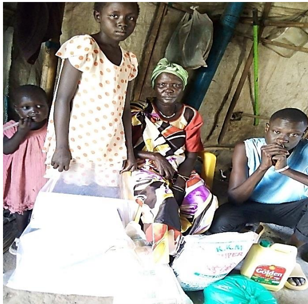
A single mother received plastic sheet, mosquito nets, food items Malakal IDPs camp

The most affected hard-hit areas were Jonglei, Upper Nile, Northern Bahr el Ghazal, Unity, Warrap and Central Equatoria.