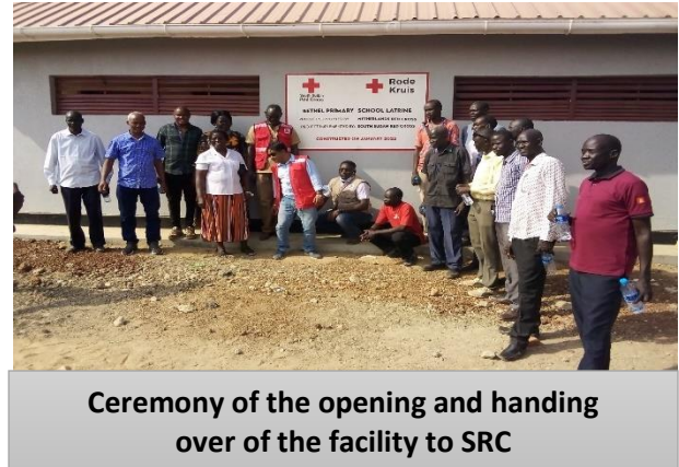
Ceremony of the opening and handing over of the facility to SRC