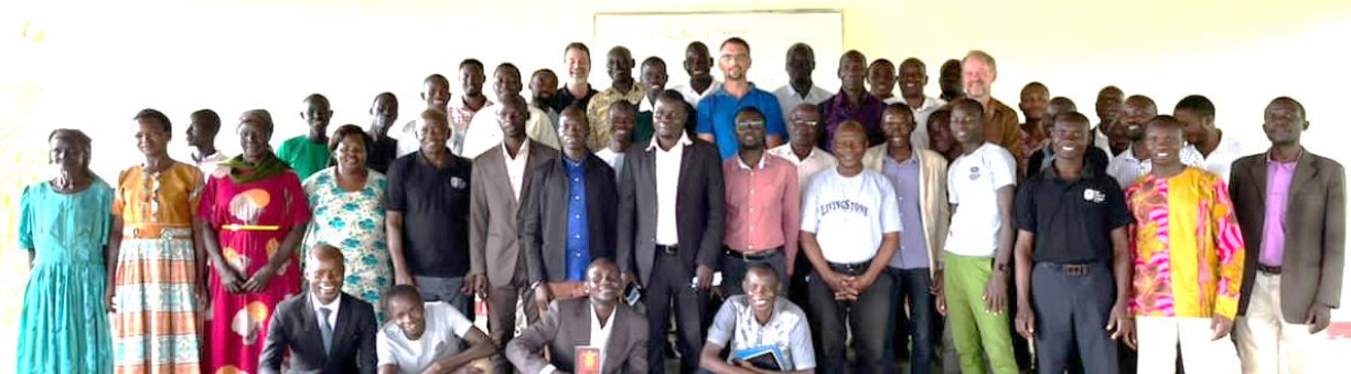
Participants of Uganda Pastoral Conference conducted at Knox School of Theology