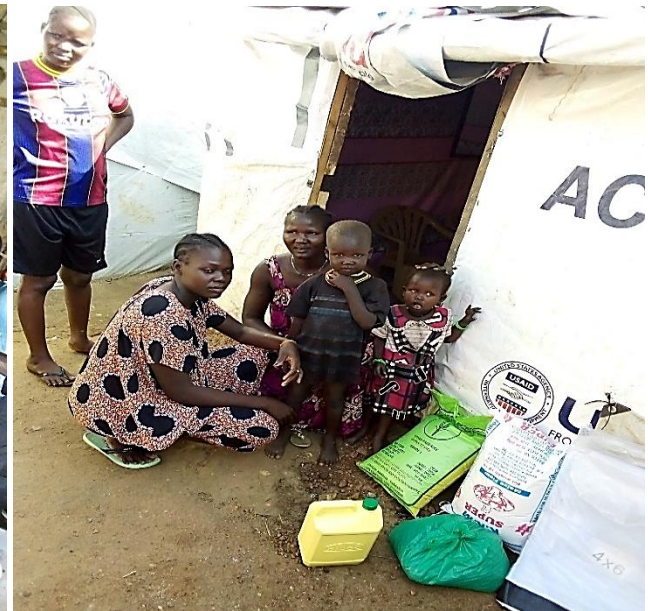
A widow received plastic sheet, mosquito nets, food items Malakal IDPs camp

With prompt generous response, WORD AND DEED donated some fund to provide some essential household items such plastic sheet, mosquito nets and basic food items to most affected areas in South Sudan.