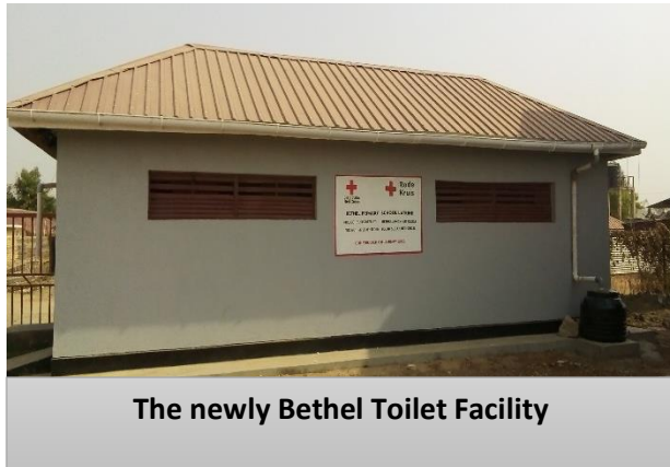
The newly Bethel Toilet Facility