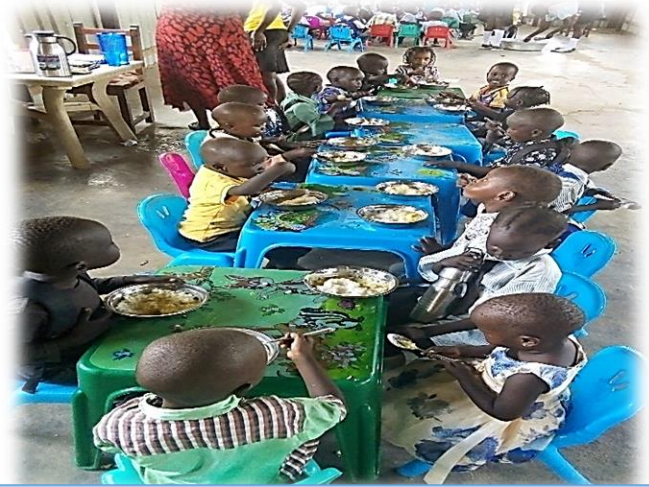
Nursery Kids taking their meal

Hunger and malnutrition are serious risks to children's health and education. SRC schools feeding program has been introduced to provide a daily hot meal to pupils. The overall aim is to provide daily hot meal to 450 pupils at Bethel Primary School and 400 pupils at Grace Primary School. Each child will have a plate of rice or maize flour with beans or lentil per a day. The nursery pupils will have a rice with milk once a week.